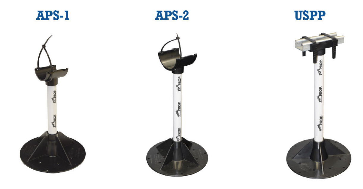
FIGURE 1—APS-1 (LEFT), APS-2 (MIDDLE) AND USPP (RIGHT) MODELS