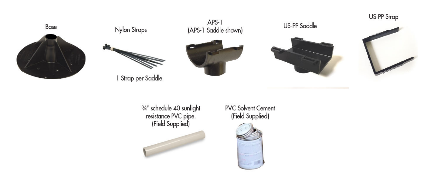
FIGURE 2—PIPE PROP COMPONENTS